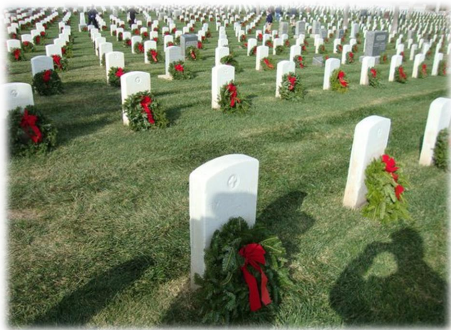
These fresh wreaths decorate the hundreds of gravesites of our veterans throughout Fort Rosecrans as well as Miramar National Cemetery in San Diego, honoring all those here for their service and sacrifice to our great country.