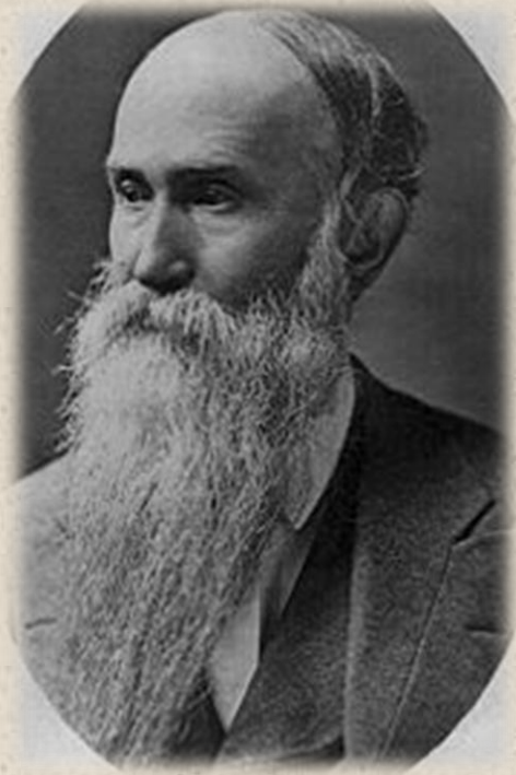
Jubal Early in later years